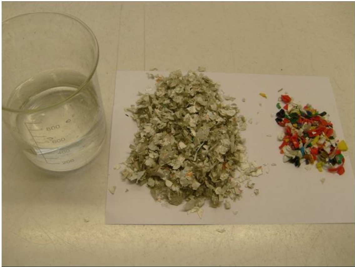
Photo 1: From left to right, beaker with 300 ml water at pH 7,5; label sample; regrind caps sample